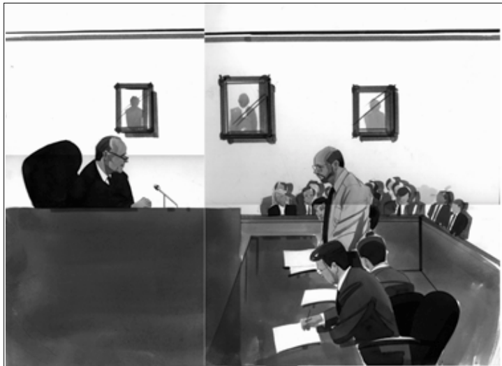
Judge addresses convicted defendant during sentencing

An appeal in a federal criminal case usually proceeds in the following manner: Suppose a law is passed by Congress that prohibits demonstrations within 500 feet of any embassy. Following the enactment of the law, a group of six people stand on a street corner near the embassy of Malandia and ask passersby to sign a petition protesting Malandia's for-