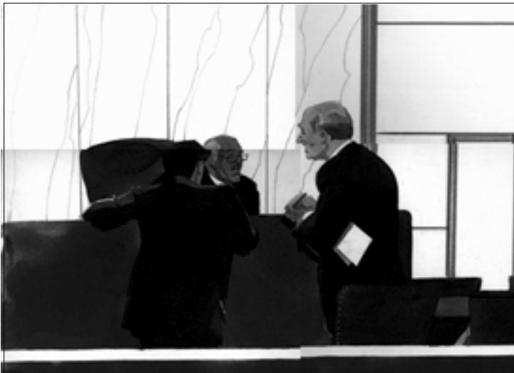
Attorneys meet the judge at the bench for a sidebar

Closing arguments and instructions. After the evidence has been presented, the lawyers make their closing arguments to the jury, concluding the presentation of their cases. Like the opening statements, the closing arguments don't present evidence but summarize the most important features of each side's case. Following the closing arguments, the judge gives instructions to the jury, explaining the relevant law, how