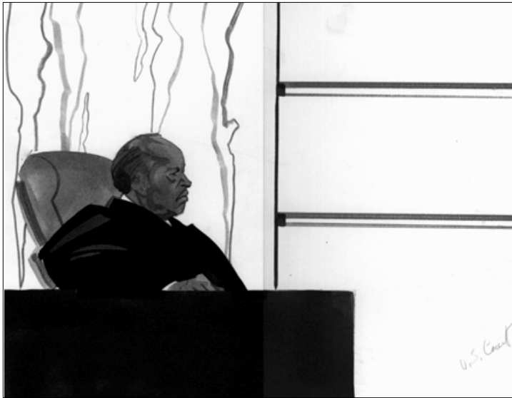
A federal judge presiding over a trial

The Constitution includes both of these protections—life tenure and unreduced salary—so that federal judges will not fear losing their jobs or having their pay cut if they make an unpopular decision. Sometimes the courts decide that a law that has been passed by Congress and signed by the President, or a law that has been passed by a state, violates the Constitution and should not be enforced. For example, the Supreme Court's decision in Brown v. Board of Education in 1954 declared racial segregation in public schools to be unconstitutional. This decision was not popular with large segments of society when it was handed down. Some members of Congress even wanted to replace the judges who