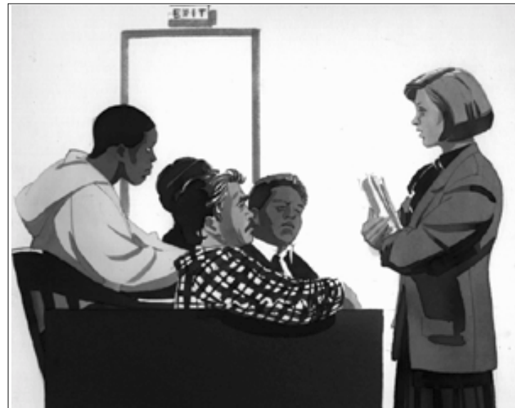
An attorney makes her opening statement to members of the jury

The lawyers often introduce documents, such as bank records, or