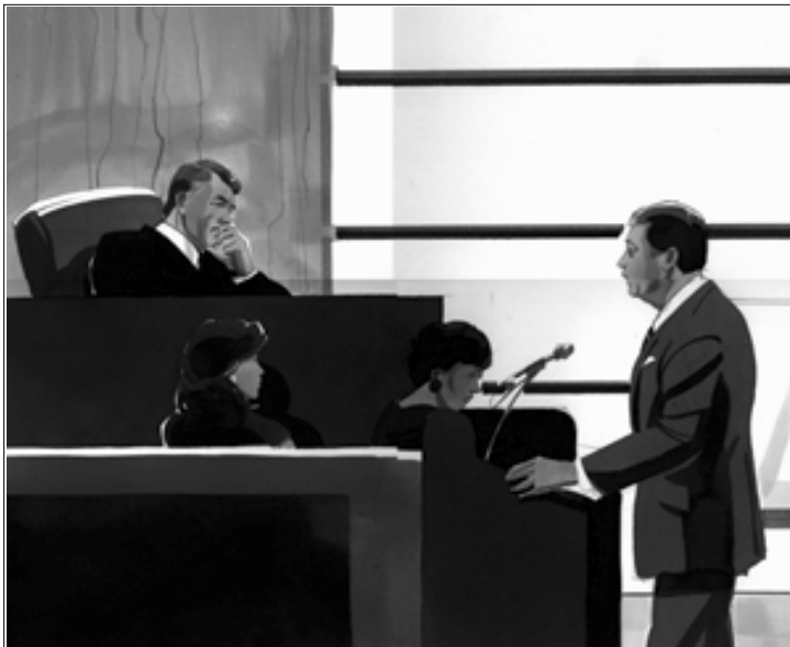
Judge listens to attorney's argument (note courtroom deputy and court reporter)

The courtroom deputy or clerk. The courtroom deputy or courtroom clerk , who is usually seated near the judge, administers the oaths to the witnesses, marks the exhibits, and generally helps the judge keep the trial running smoothly. Sometimes the deputy or clerk is away from the courtroom performing other tasks during parts of the trial. The courtroom deputy is employed by the office of the clerk of court . The clerk of court is appointed by all of the judges on the court and works closely with the chief district judge , who is responsible for the court's overall administration.