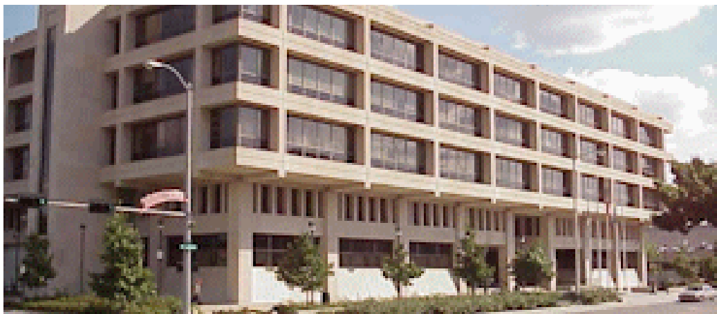
Robert V. Denney Federal Building

The U.S. District Court is located at the Robert V. Denney Federal Building at 100 Centennial Mall North near 16th and O Streets. Entrances are located on the east and west sides of the building.