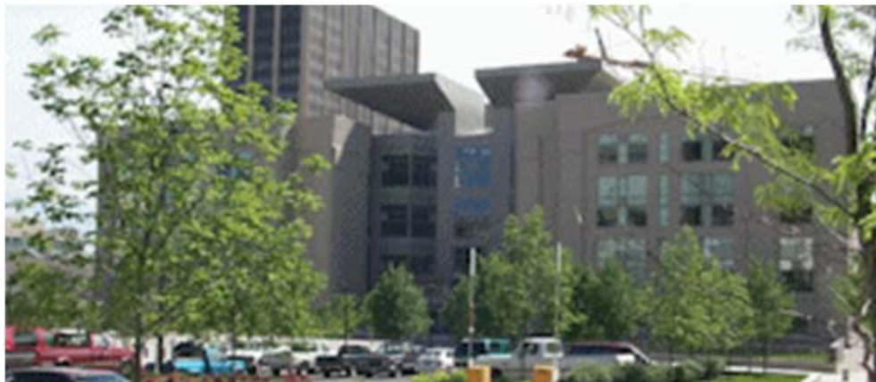
Hruska U.S. Courthouse

***DO NOT REPORT to the Douglas County Courthouse at 1701 Farnam.*** The U.S. District Court is located at the Hruska U.S. Courthouse at 111 South 18th Plaza near 18th and Douglas Streets. The entrance is located on the west side of the building.