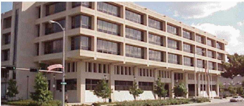
Robert V. Denney Federal Building

The U.S. District Court is located at the Robert V. Denney Federal Building at 100 Centennial Mall North near 16th and O Streets. The public entrance is located on the west side of the building.